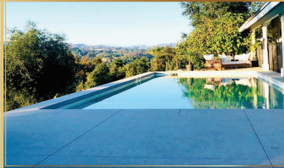
Left: Lux Landscape Design's Cat 303E CR mini excavator performs a difficult cliffside pool excavation in Fallbrook.