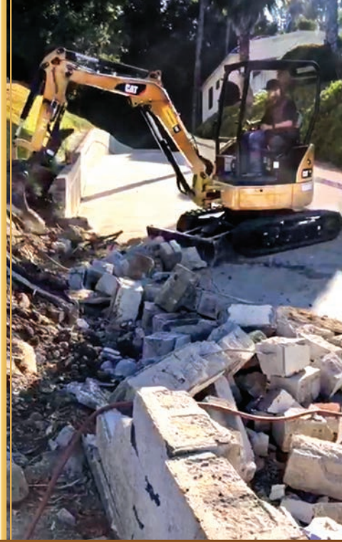
Far Right: Lux Landscape Design's Cat 303E CR mini excavator trenching for irrigation in San Diego County.