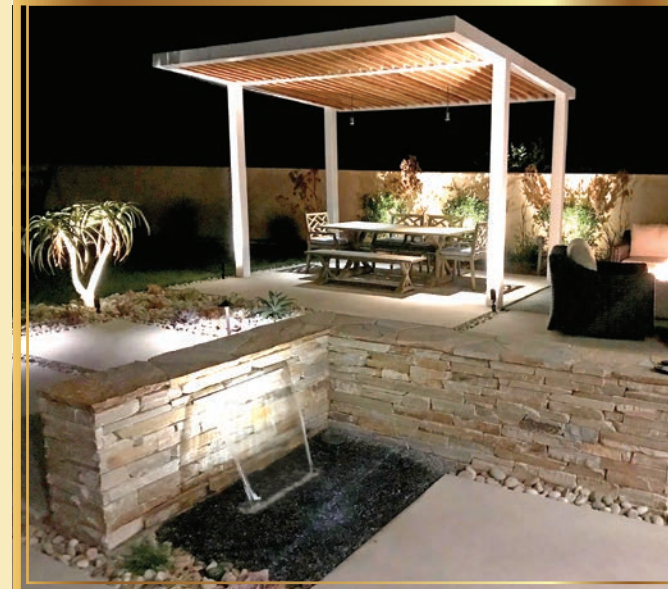
Left: Lux Landscape Design's Cat 242D skid steer loader backfills trenches for utilities on a custom backyard resort in Fallbrook.