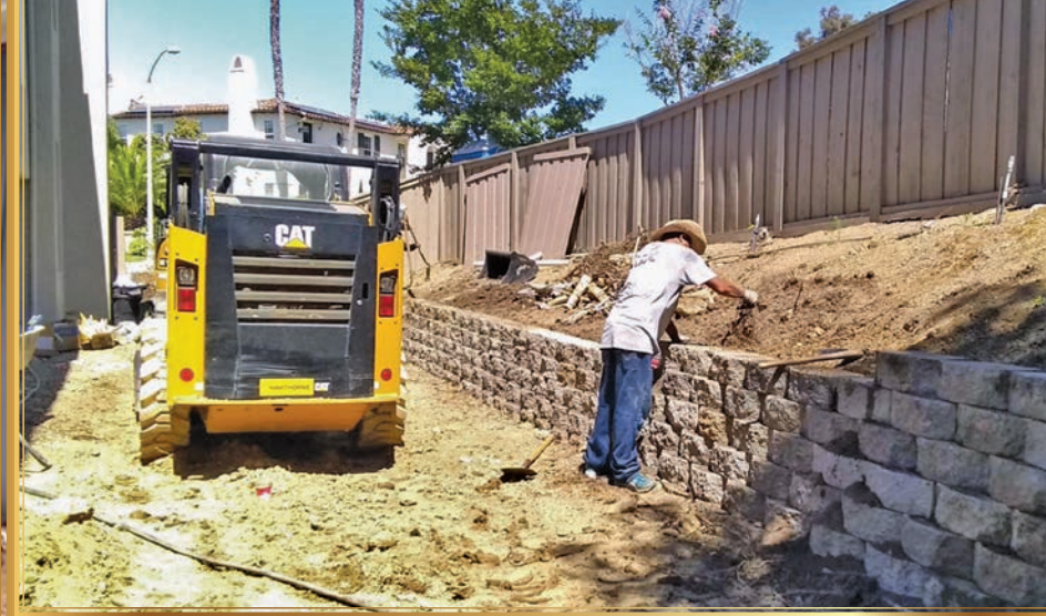
Above: Lux Landscape Design reconditioned and upgraded retaining wall to create open space for multi-purpose grass area and playground structure in San Diego County.