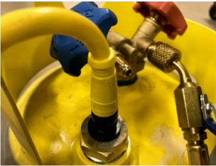
Umbilical Mounted to Tank