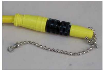
Umbilical with Shorting Cap