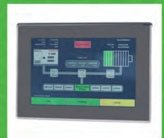
Touchscreen Control Panel Large 10" display

All voltages are available simultaneously