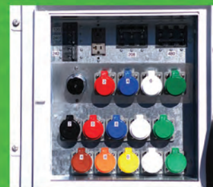
Single-Phase (110/240V) and Three-Phase (208/240/480V) Receptacle Outlets

All voltages are available simultaneously